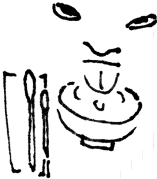
illustration: Asta Plum

A very fine restaurant should have at least one dish that anyone could pay. One dish for the artists, one good meal at the menu, one cheap and good. The dish would make you full and happy, that would make a good play, Money would mix. Curious of how good it would work, so much more fun at the dinner tables. Mix of social classes is sexy, someone's gotta make it happen. All that milk and honey, mix it with butter and eat it with bread. Give me a little kiss and I'll give you a dance. Bubblegum honey moon, take a look at the very best wedding pictures. You will see, they look happy cause they got the impossible, Love. Sex. Holidays full of roses. Kind of like it.