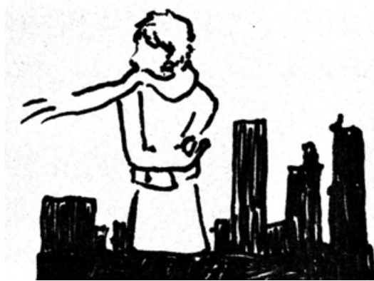
Illustration: Asta Plum

XXI CROOKED MIRROR - a weekly column - Det Kosmiske Hierarki