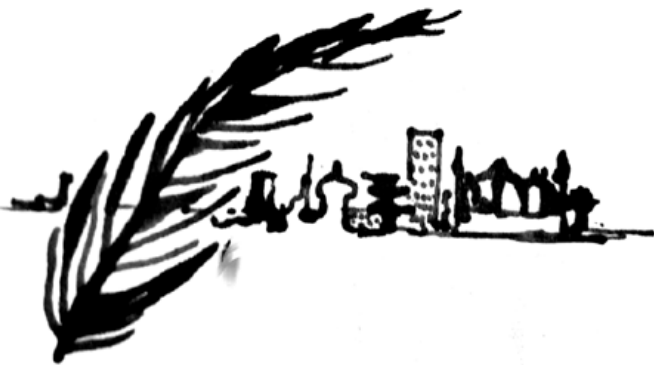
illustration: Asia Plum